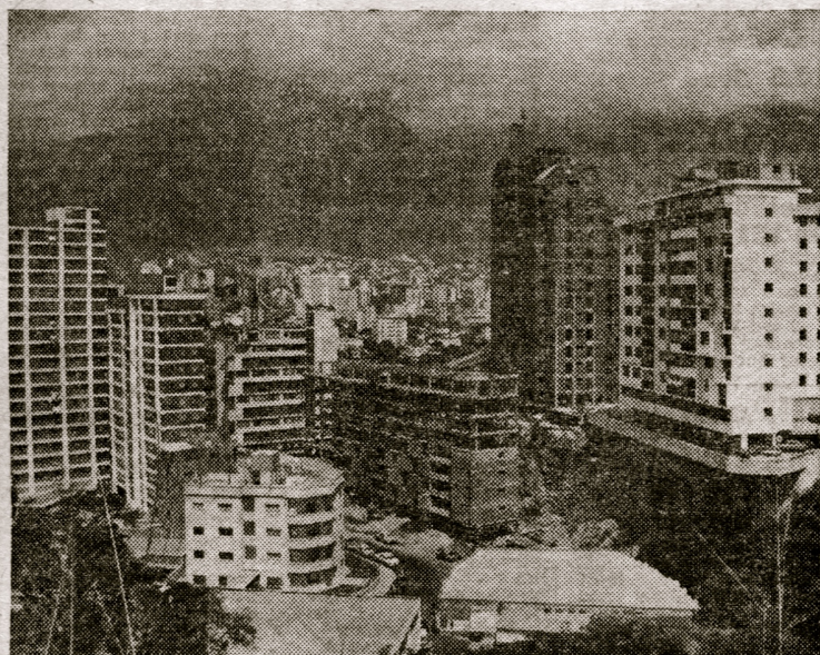
The 12th floor of an office block houses the Embassy of Our Man in Caracas. Some of the challenges of diplomatic life are examined: 9.55

11.40-11.50 Closedown ROSALIND SHANKS reads Summertime by A. ALVAREZ